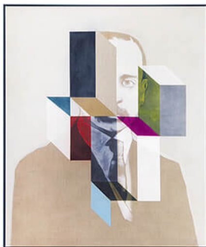
Cloudgazer (2015); acrylic and ink on canvas