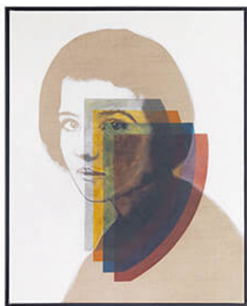
(Top) Saturnine sky, 2015; paper and epoxy on board; (above) Contemplating a peacock (2015); acrylic, ink on canvas

Bitzer explains that the protagonists in his works evolve from various sources, including fictional characters from stories. "In some cases, my endeavour is to deconstruct their origin, transforming them into some sort of universal symbol, which stands in no relation to these parameters. In Islands and Chains , I refer to Eleonora Duse and Rilke, but not for reasons of narrative or nostalgia. It