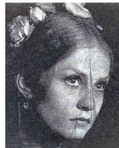
These Flowers Will Never Die (Lady of the Camellias) Laser engraving on granite