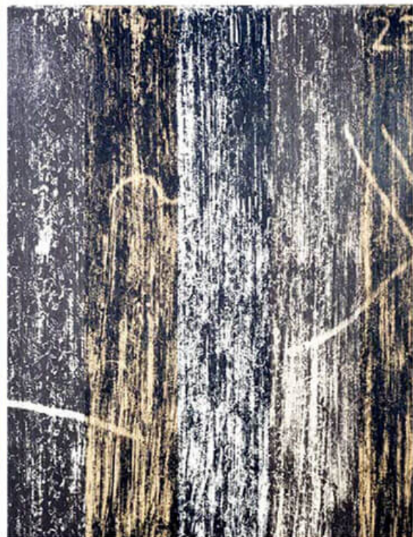
The dark beauty of mistake (Swans), 2011 Cassette tape and acrylic paint on canvas